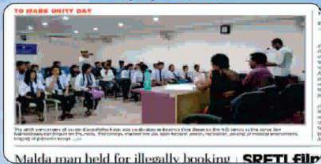
Unity Day Celebration