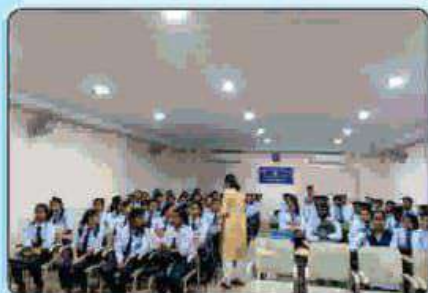
Joint Counselling with Students Organised by Department of English