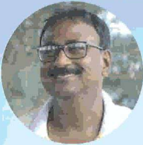
The Mind Behind the celebration of College Foundation Day