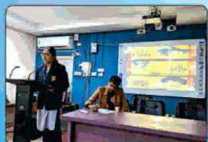
Students' Seminar on The Good The Bad The Ugly : Textual Encounter with Fascinating Characters by Department of English