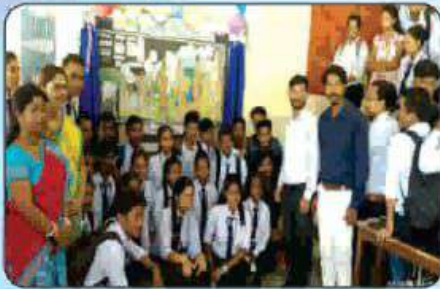
Publication of Wall Magazine by (Shakabda III )