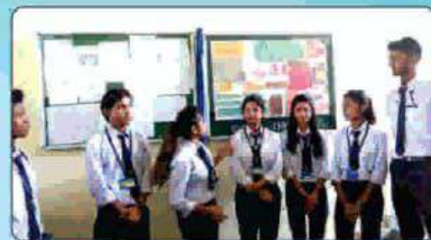
Publication of Wall Magazine by Department of Commerce (Commerce Chronicle)