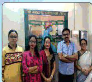
Publication of Wall Magazine by Department of English (The Oracle Vol. 2)