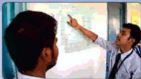
Poster Competition by Department of Chemistry