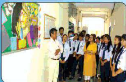
Krishti Vol.- 2 Publication Of Wall Magazine By Department Of Sociology