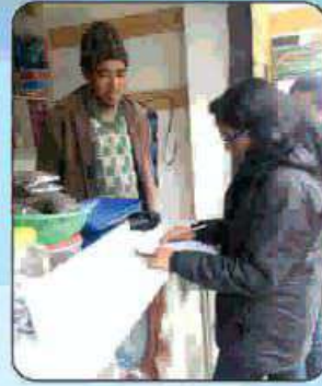
Field Work Organised by Department Of Geography