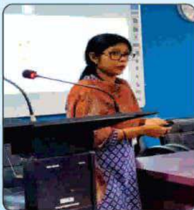
Special Lectures On Photography... and Publishing Research Articles... Organised by SSM Research Cell