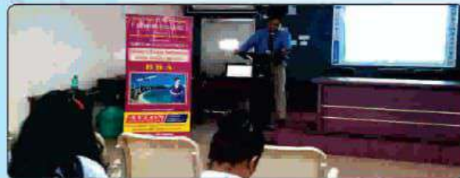
Program of Placement Cell